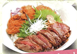
Seafood rice bowl, BBQ, etc.